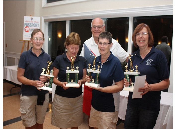
Winners of the Best Team and the Most Honest Team