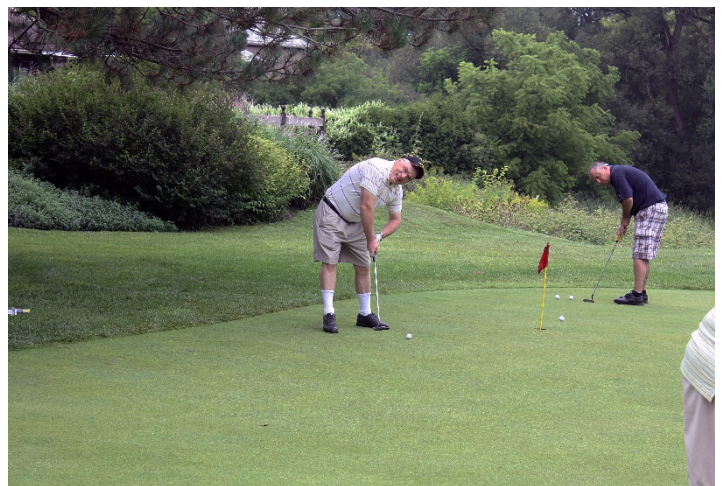
Practise, practise, practise.