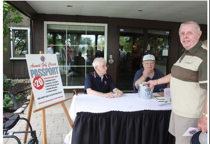
Registration desk and Passport sales