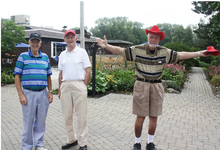
"I was this close"