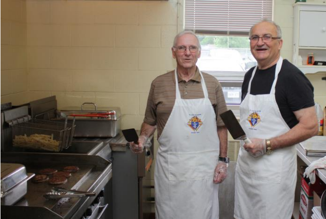
Two guys and fries.