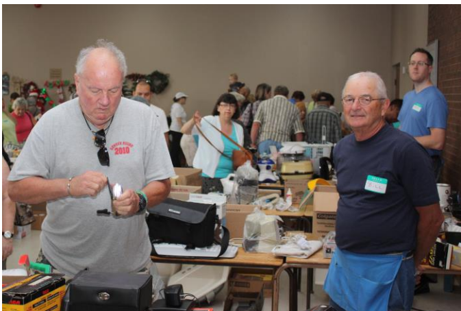
21, 22, 23, 24, .....