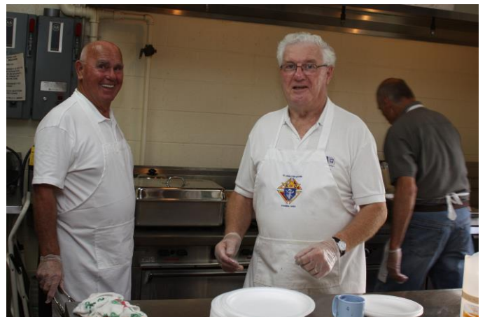
The breakfast club.