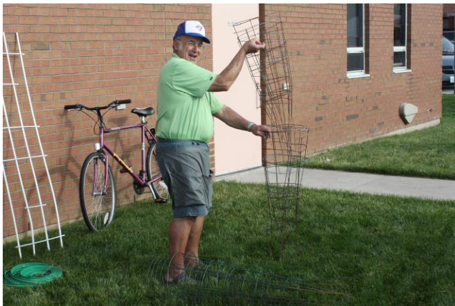
“Look Ginger, I’m wired.”