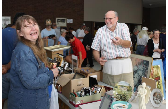
Now meet a silly salesman.