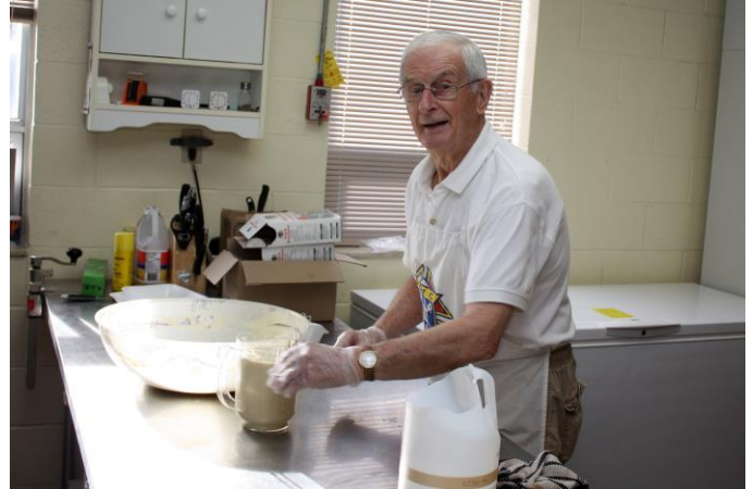
Stirring pancake batter or stirring up trouble.