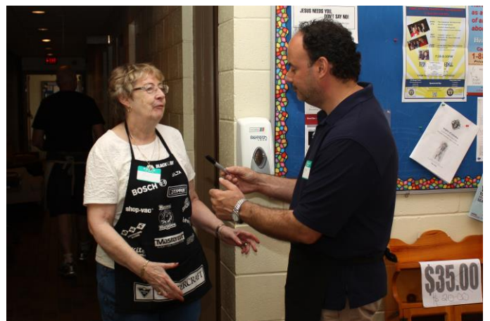
“Only $35 and it’s yours today.”