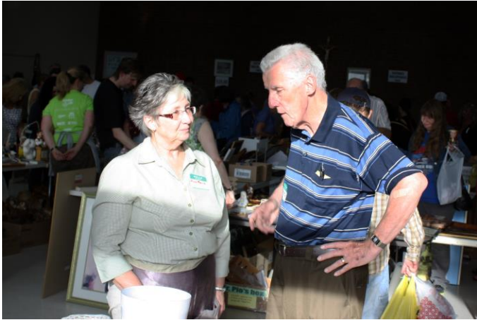
“Let me tell you about my week!”