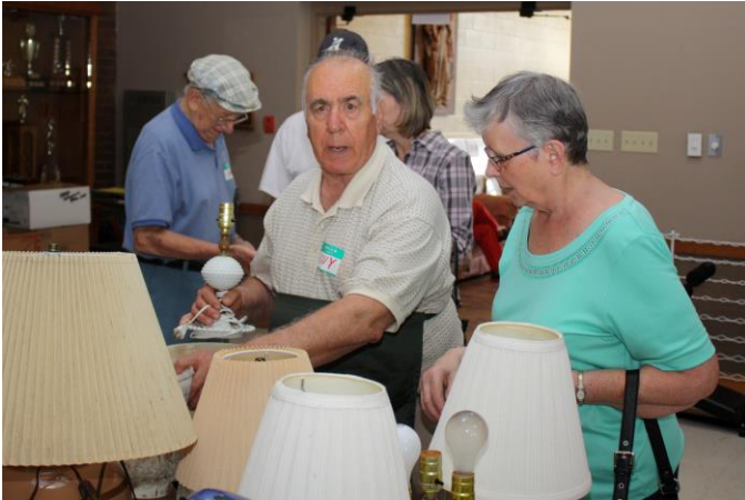
Meet a shady salesman.