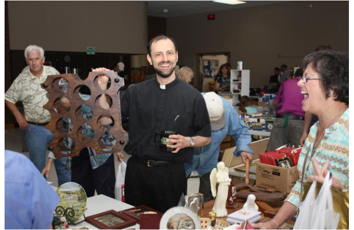
“Look, a holy relic.”